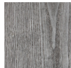
AGED THERMALLY MODIFIED ASH